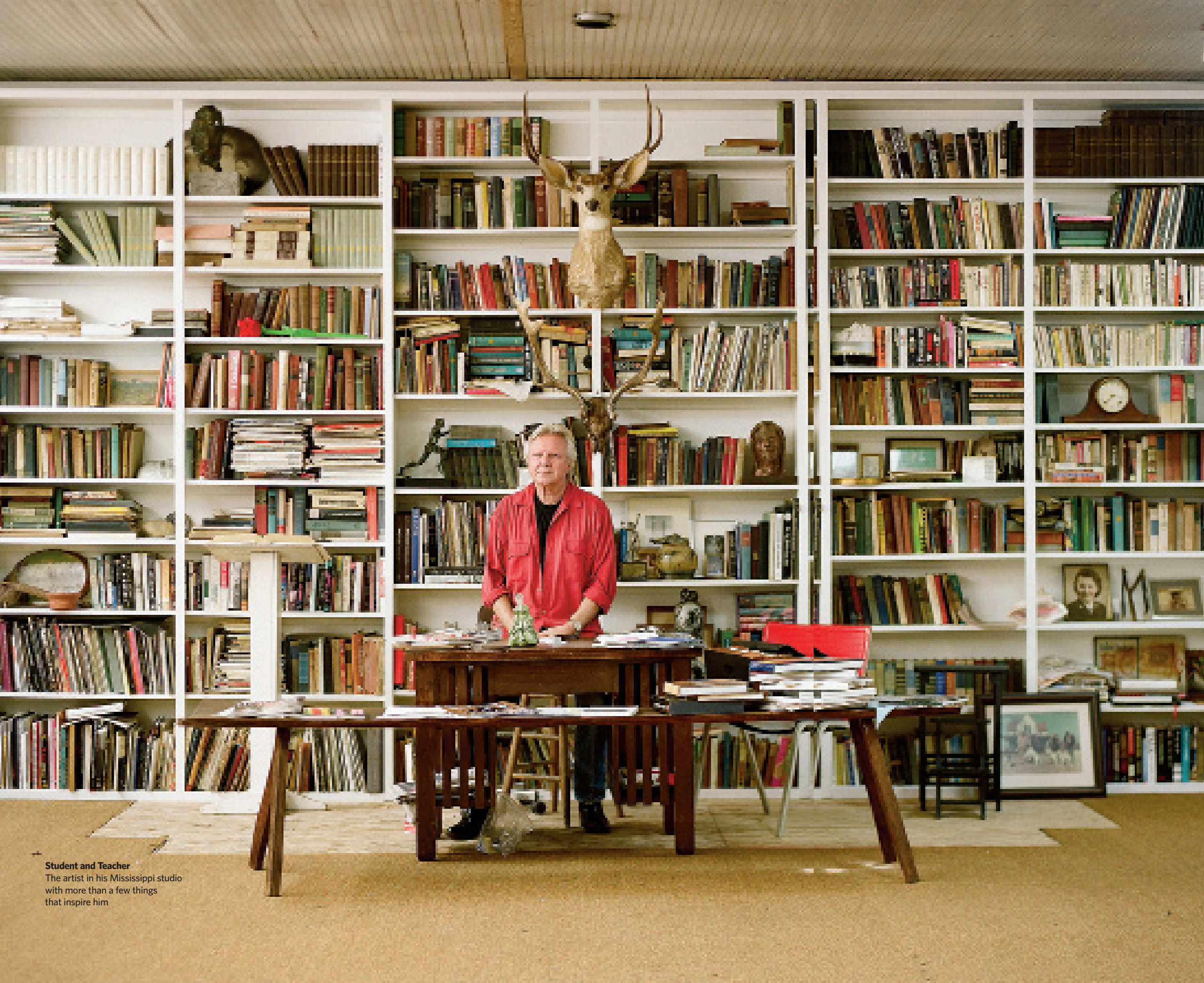
Student and Teacher The artist in his Mississippi studio with more than a few things that inspire him